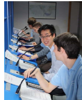
Simulation of the launch of the space shuttle.

Different activities took place following a rigorous procedure inspired by the current standards at the European Space Agency (ECSS). Students fulfilled data-packages defining the interfaces of their subsystems, which were then reviewed by panels (composed of professors and industrials). These panels formally emitted comments and remarks, which were answered by students. These answers were discussed during a weekend gathering the whole team and the panels at the EuroSpace Center. This weekend was also an excellent opportunity to strengthen team spirit.