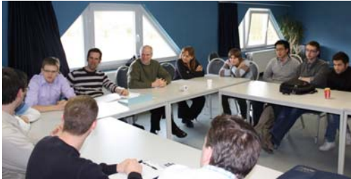
Meeting in Redu.

The OUFTI-1 team is currently concluding its first review process. This technical review focuses on interfaces (i.e. mechanical, electrical, thermal, and operational boundaries between subsystems), since there was a crucial need to check and definitively fix them. The so-called Interface Technical Review (ITR) appears to be also an excellent opportunity for education: students get familiarized with a process widespread in industries and agencies.