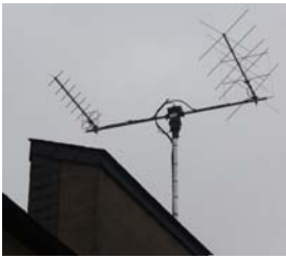
Antennas at the ULg