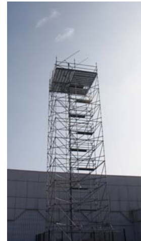
Antenna tower in Redu.

The two tracking stations were introduced in the last newsletter. Last month, the antennas of the main ground station were installed on the roof of the Montefiore Institute, at the University of Liège. Final connections and first tests are scheduled for this week.